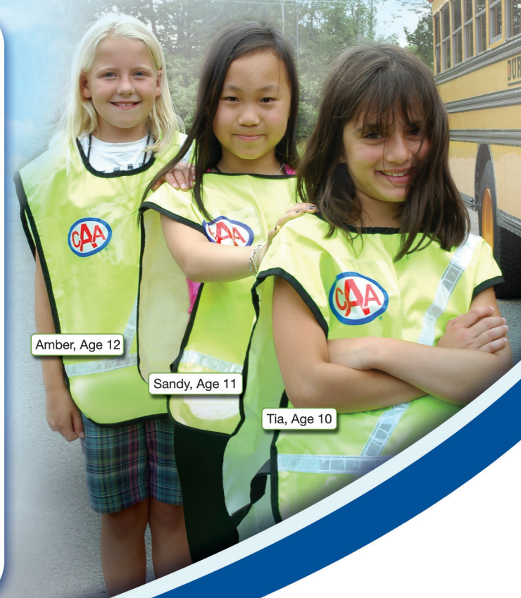
Amber, Age 12

Shpend Bytyqi and Devdutt Kamath were on foot patrol duty when they stopped a grade one student from running into traffic just as a van was approaching. Their skills saved a little boy from serious injury.